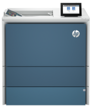
HP Color LaserJet Enterprise X654dn Printer

This printer is intended to work only with cartridges that have a new or reused HP chip, and it uses dynamic security measures to block cartridges using a non-HP chip. Periodic firmware updates will maintain the effectiveness of these measures and block cartridges that previously worked. A reused HP chip enables the use of reused, remanufactured, and refilled cartridges. More at: http://www.hp.com/learn/ds